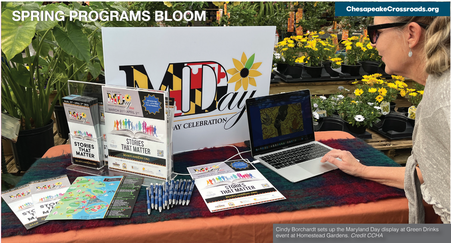
Cindy Borchardt sets up the Maryland Day display at Green Drinks event at Homestead Gardens.